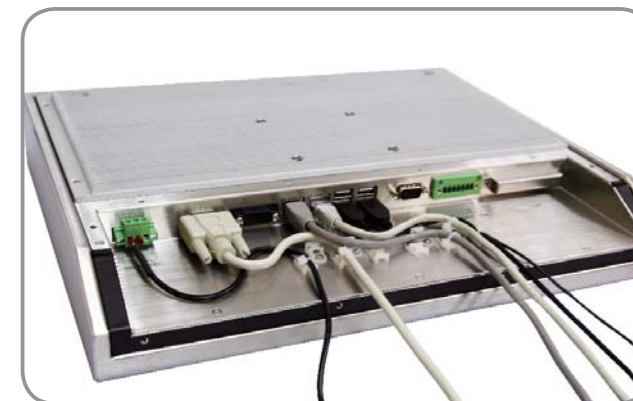
APC-3X82 Reliable Cable Bracket Design