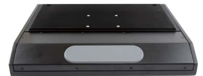
APC-3X83 Series Steel Enclosure, Black Color